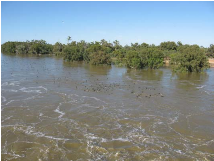
Lake Cawndilla bird life.

The second NSW requirement was that the environmental values of the lakes could not be compromised. However, the Commonwealth's proposal involved the surcharge and extended inundation of the two upstream lakes in the system, including the floodplain of the Darling River that connects the four smaller lakes.