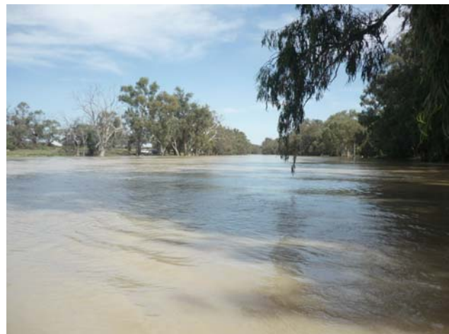
Looking down stream at remnant pools of water during nil flow down the Darling River at Tulney Point 14 Jan 2008 and the same spot during high flows 3 April 2012.

Located in a semi-arid environment subject to highly variable flows, the Menindee Lakes are also subject to high evaporation rates. On-average, 425,000 megalitres is lost from the Menindee Lakes through evaporation each year. This compares with 745,000 megalitres which is lost from the Lower Lakes in South Australia through evaporation each year.