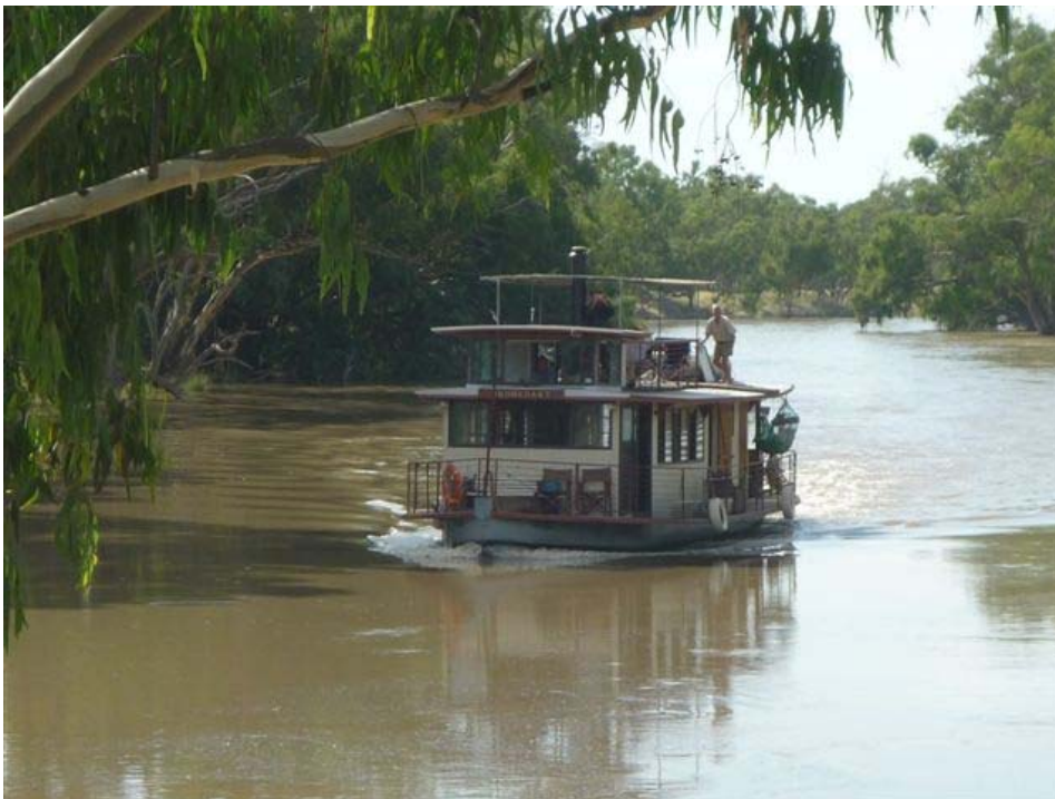
Paddle streamers in the Darling River, downstream of Menindee.

It is important that the management of the Menindee Lakes now, and into the future, addresses environmental, social, economic and cultural issues, both at the regional and Basin-wide level.