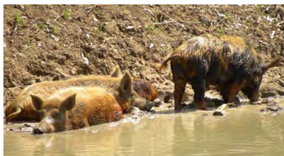
Feral pigs wallowing in a creek, Kimberley area, WA.

and will eat the eggs of ground-nesting birds, reptiles and amphibians and directly prey upon lambs, frogs and marine and freshwater turtles 2,3 .