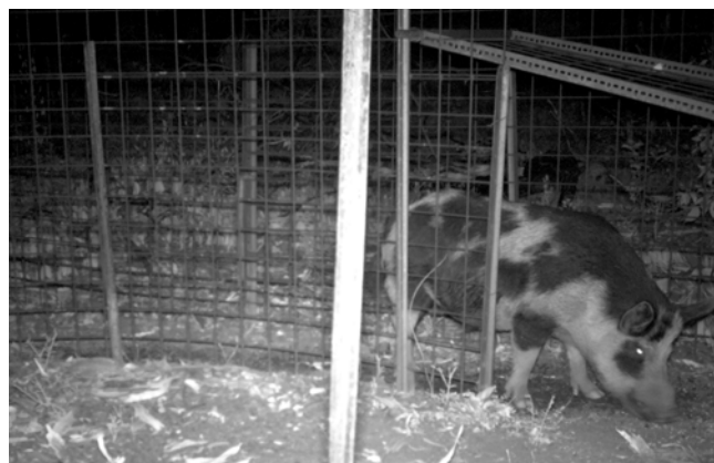
Remote camera captures feral boar entering pig trap, Kangaroo Island, SA.

Trap design and process: Trap designs vary considerably. In Australia, the most popular styles used tend to be silo, panel or box traps. All basically consist