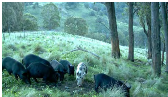
Feral pigs feeding at a 'cluster' bait station, Glenrock Station, NSW.

Toxicants: In Queensland, New South Wales, Victoria and Western Australia, the odourless and tasteless compound 1080 (sodium fluoroacetate) is routinely used to poison feral pigs. Yellow phosphorous (commercial names: CSSP, SAP) is registered for feral pig control in some Australian states and territories, but because of animal welfare concerns surrounding its use, it is being phased out 6 . Warfarin and cyanide are available for experimental purposes, but both are unsuitable for feral pig control due to issues with humaneness, and taste and delivery 7 respectively. The fast-acting and more humane poison sodium nitrite, a common human food preservative, is highly lethal to pigs and currently undergoing registration in Australia 8 . This new toxicant, which must be specifically formulated, is expected to be available from 2013.