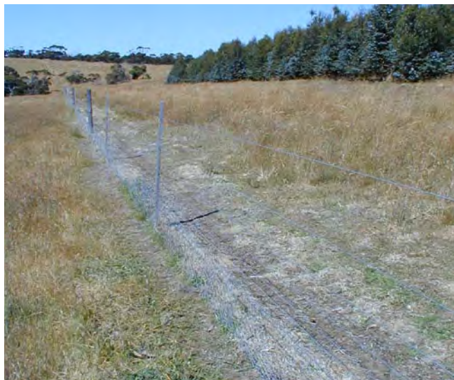
Exclusion fencing, Kangaroo Island, SA.

Effective control of invasive animals rarely works with a single-strategy approach. The listed feral pig control techniques in this factsheet are best used together in a strategic fashion to manage feral pig populations, and reduce their impacts on farms and the environment. The techniques should be appropriately chosen based on environmental conditions, timing, habitat and the desired outcome. For further details on how to successfully design and implement feral pig management strategies please refer to the various resources and guides listed at right or visit http://www.feral.org.au .