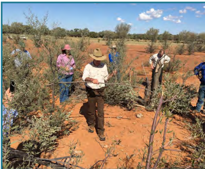
Above: Col measuring mulga forage availability.