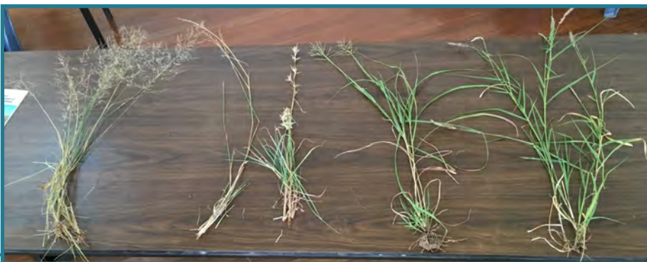
Left: Can you identify these "3P" grasses?