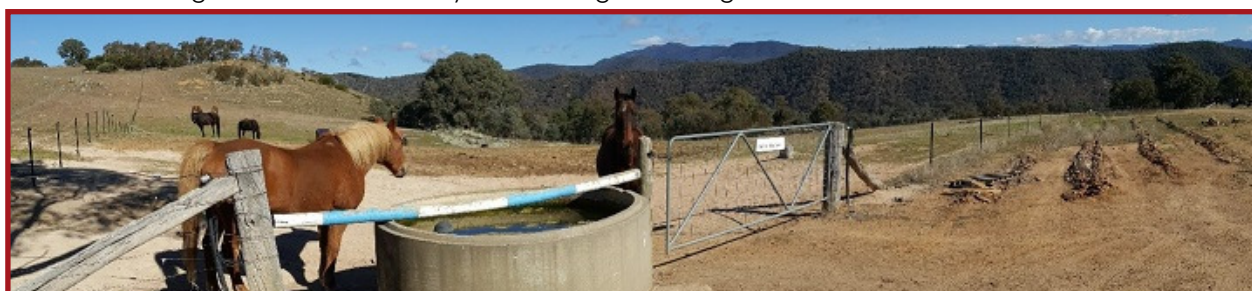
Above: Managing erosion on horse agistment land.