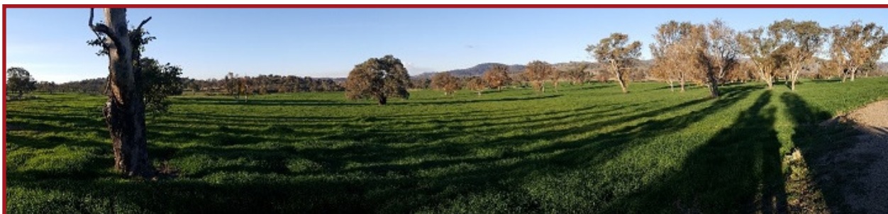
Above: Tackling African Love Grass by over sowing with forage oats.